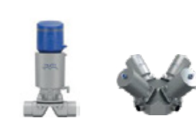
Unique DV-ST UltraPure