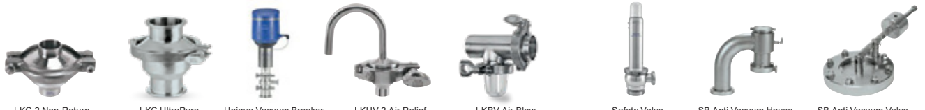
LKC-2 Non-Return LKC UltraPure Unique Vacuum Breaker LKUV-2 Air-Relief LKBV Air-Blow Safety Valve SB Anti Vacuum House SB Anti Vacuum Valve