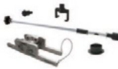
Service tools mixing and blending