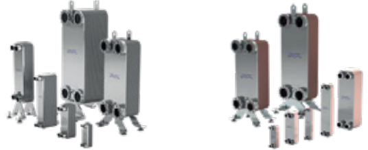
AlfaNova Brazed PHE