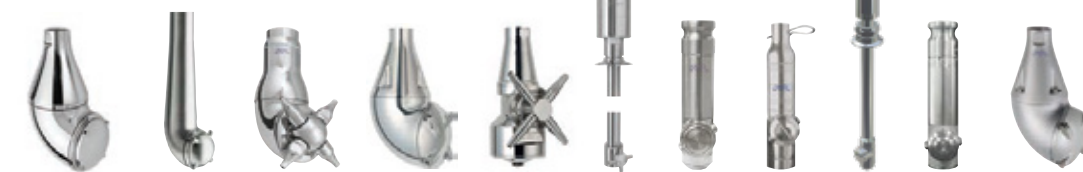
SaniJet 25 UltraPure