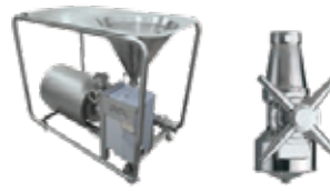
Hybrid Powder Mixer