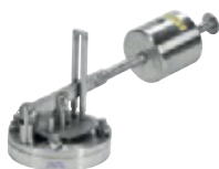
SB Pressure Relief Valve