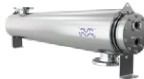
Pharma-line S and P