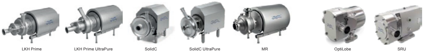
Rotary lobe pumps