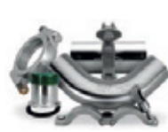
UltraPure tubes and fittings