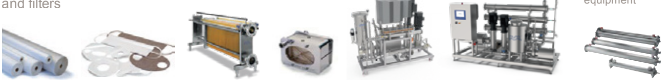
Spiral membranes Flat sheet membranes Plate and frame module LabStak™ modules Pilot plants Membrane filtration systems Housing