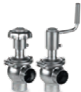
Unique SSV Manual