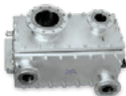
Combabloc Free Flow