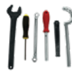
Service tools tank cleaning