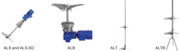
ALS and ALS-SD