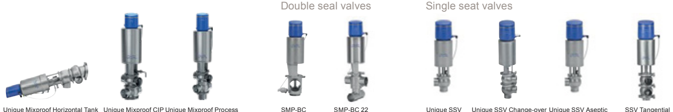
Double seal valves