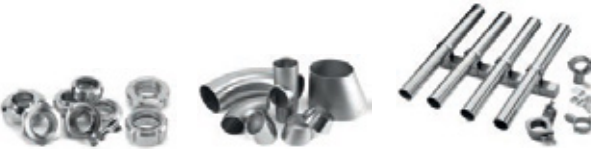
Flanges, clamps and unions