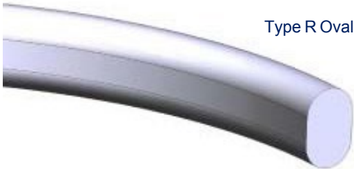
Type R Oval