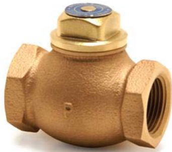
Bronze horizontal lift check valve Female ends, PN32