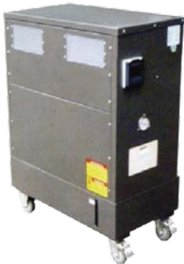
YADB-06HL YADB-09HL YADB-12HL