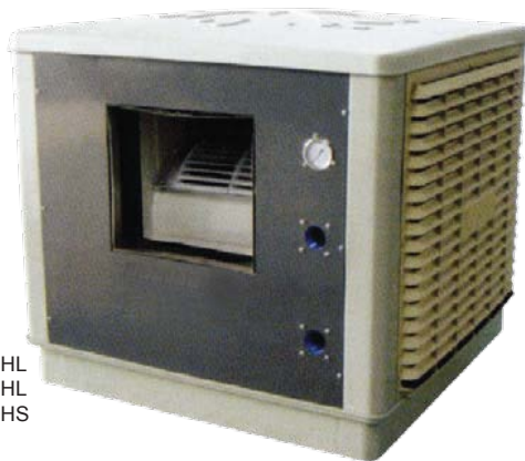
YADS-18HL YADS-24HL YADS-30HS