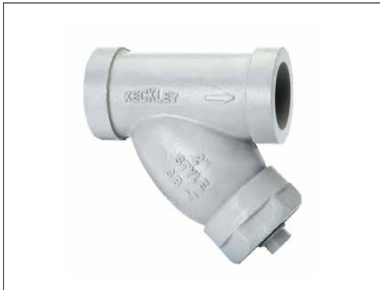
Cast Carbon Steel Y-Strainer